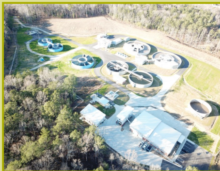
TCWWTP is located at 5812 Hilltop Road