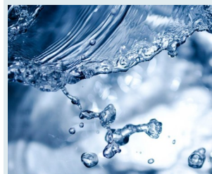
The disinfection process is state mandated.