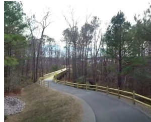
Park Depot Trail

Public input on the Parks, Recreation, and Cultural Resources Comprehensive Systemwide Facility Master Plan concluded in early February. Town staff is currently evaluating all responses gathered through four public input sessions and an online survey. An internal needs assessment is underway to evaluate the current and forecasted facility and park needs.