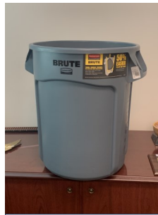
Use a 20-gallon container for yard waste

On July 1, 2020, the Town will no longer accept bagged yard debris. This is due to our collection facility no longer accepting bagged yard debris after this date therefore the Town is required to eliminate bags from the yard debris collection process.