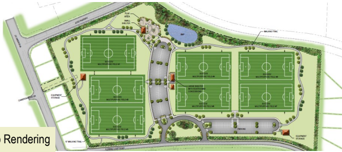
Fleming Loop Rendering

The WRAL Freedom Balloon Fest held at Fleming Loop Park was nothing less than spectacular! The park, however, will close in June for renovations and upgraded amenities that include the addition of seven new multi-purpose fields, a concession stand, restroom facilities, field lighting, playground equipment, picnic shelters, a walking trail, an expanded, paved parking area and road improvements along Fleming Loop Road. Construction is expected to take 10 months and cost approximately $3 million. The Town of Fuquay-Varina received a total of $1 million in grants from PARTF and Wake County Major Facilities to fund the Fleming Loop Project.